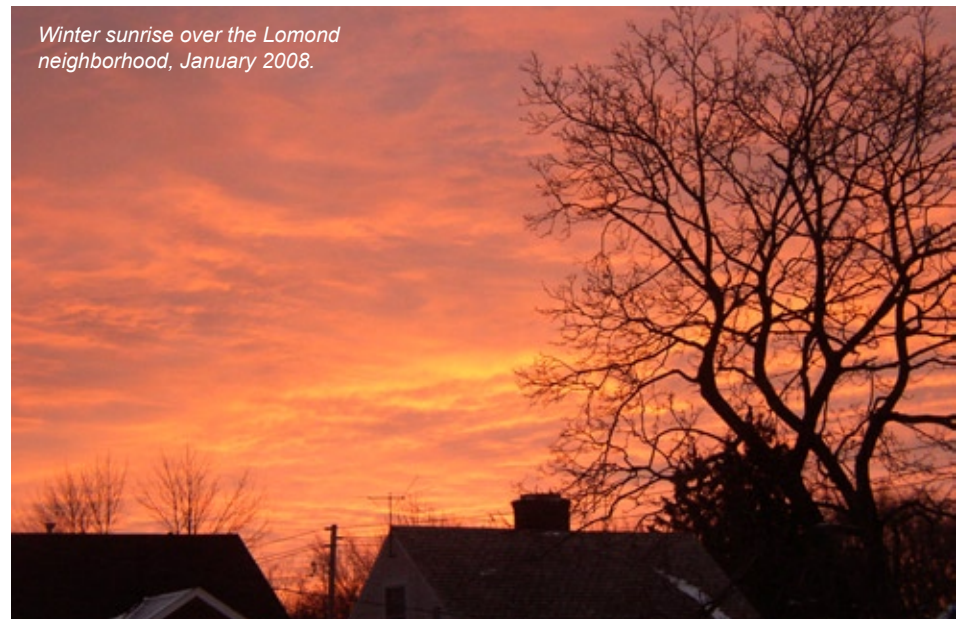
Winter sunrise over the Lomond neighborhood, January 2008.

The Lomond Association is a 501(c)3 non-profit, residential neighborhood organization.