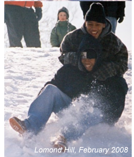
Lomond Hill, February 2008